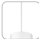
3m White Suspension Kit